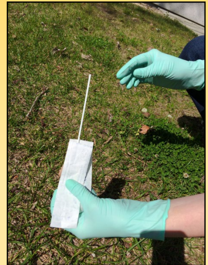
A partially unwrapped swab