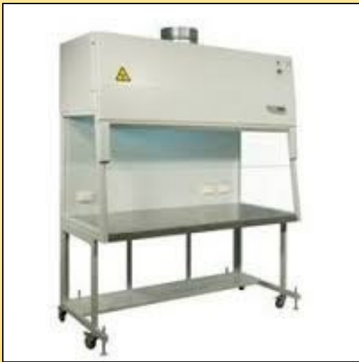
Work in BSC

If your lab has a BSC, transport the bird to the laboratory to work in the BSC.