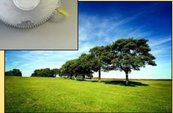
Work outdoors wearing N-95 mask