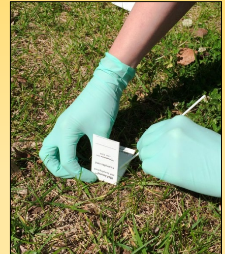
Press and roll swab onto card