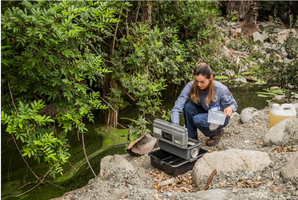
A vector control technician sets a mosquito trap.

One of the largest components of any vector control operation is surveillance directed at adult mosquitoes because this is the stage that mosquitoes transmit diseases. Since identifying all potential mosquito sources is not possible, districts rely on monitoring adult mosquito activity to identify and prioritize problem areas.