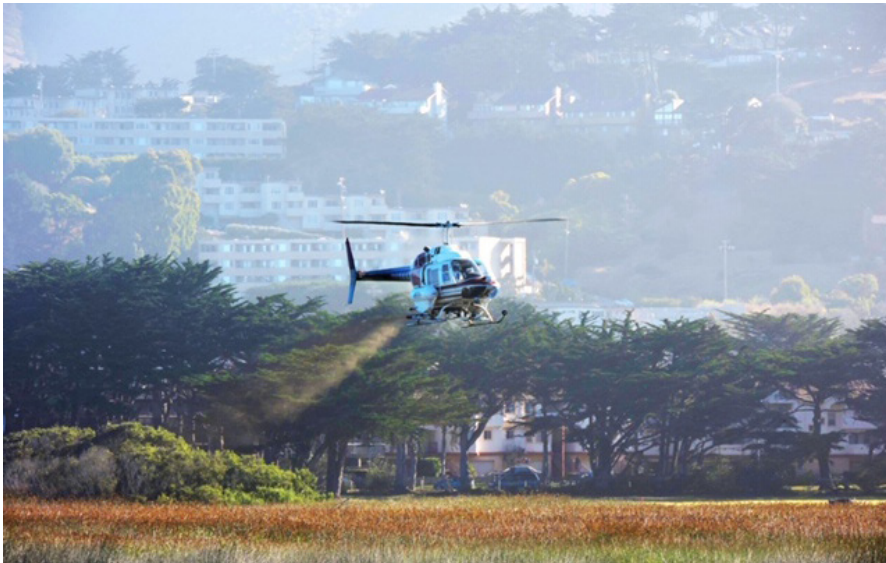
A helicopter is used to apply larvicide to a marsh.

However, the main advantage of targeting larvae is also its greatest limitation: the water source containing the larvae must be identified and directly targeted. Whether a single storm drain treated by hand or acres of flooded field treated by plane, the larvicide product must find its way into the water. Use of larvicides also poses a challenge for resource management. Long-term residual products can allow for sustained control of a standing water source, but come at a significantly higher cost than short term products. Districts must not only identify active sources, but determine what type of treatment is required based on the mosquito production level and likelihood of recurrence. Districts work to continually identify, control, and when feasible remove active mosquito sources. Despite these efforts, not all sources can be discovered and adult mosquitoes will emerge heightening the public health risk.