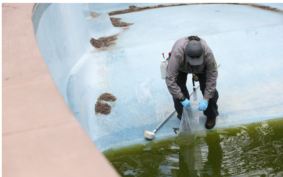
A vector control technician releases mosquitofish into an abandoned swimming pool.

Mosquitofish feed on mosquito larvae and pupae. They provide effective control when used alone or with larvicide applications in a variety of standing water habitats ranging from ornamental ponds to neglected swimming pools. However, mosquitofish do not serve as a cure-all for ongoing mosquito management. Mosquitofish should be used thoughtfully and strategically in appropriate sources to minimize any adverse impacts to other aquatic species, and when available, other native fishes should be considered for mosquito management.