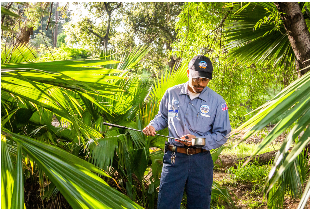
A vector control technician dips water to check for mosquito larvae.

The recent establishment of the invasive mosquitoes, Aedes aegypti and Aedes albopictus , in California presents additional challenges. In addition to being persistent day-biting nuisances, these mosquitoes are capable of transmitting several imported pathogens including Zika, dengue, and chikungunya viruses. 1 These pathogens are associated with debilitating diseases, with Zika virus being linked to birth defects when women are infected during pregnancy. 3 These pathogens have the potential to be introduced into the local mosquito population if mosquitoes take blood meals from infected travelers returning from a region where transmission is occurring.