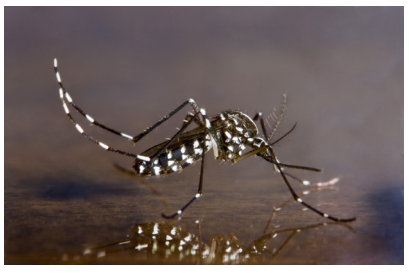
Aedes albopictus (Asian Tiger Mosquito)