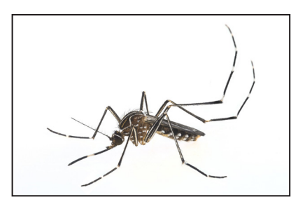
Aedes notoscriptus (Australian Backyard Mosquito)