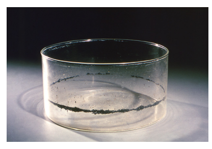
Aedes aegypti mosquito eggs